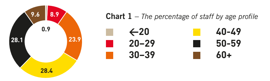
Table 4 sets out the age profile of the workforce by job family.

In a similar picture to previous years, 38% of the College's workforce is aged 50 and over, +2% increase from 2017 and 2016. 2% of staff (18 in total) continue to work for the College beyond the age of 65. See Chart 1.